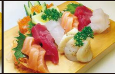
Large sashimi - 24 pcs $35.00