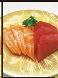
Salmon & Tuna