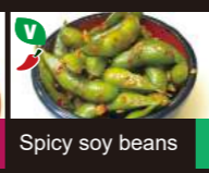
Spicy soy beans