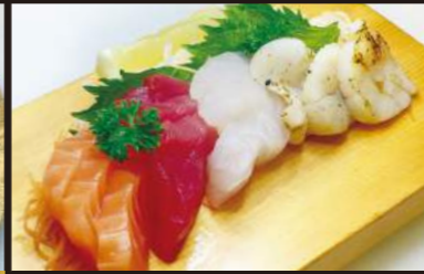
Medium sashimi - 12 pcs