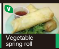
Vegetable spring roll